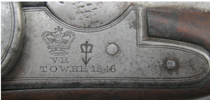
Markings: Lock plate: Crown VR, Tower 1846

Introduced in 1840 by George Lovell (Inspector of Small Arms) this pistol was made up using parts held in store for flintlock pistols, the 6 inch barrel is held in the walnut stock by a single pin and a tang screw. A steel belt hook is secured to the left side by the single side nail (lock screw) and a wood screw. The captive rammer is held in place by a spoon spring and brass pipe. The furniture is of brass and the butt plate is fitted with a steel lanyard ring.