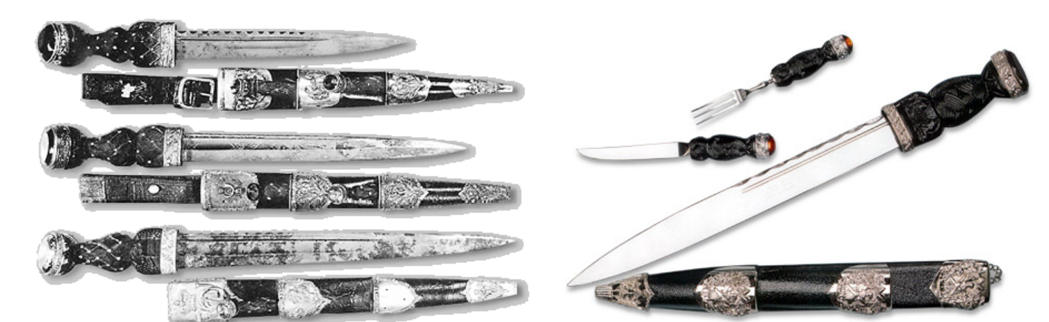
19th Century Scottish Dirks 8" 10" & 111/2" blades with eating knife and fork.

In its early days in Scotland and Ireland the Dirk was considered to be a sword. Its blade length and style varied, but it was generally 7-14 inches. However, the blades of Irish versions often were as much as 21 inches in length. In medieval Scotland, the dirk was a backup to the broadsword, and was wielded by the left hand while the shield was carried on the arm. Dirks were used to swear an oath upon in Celtic cultures. Nearly every Scottish male at the time of the oath had a dirk. This was because most Scots were too poor to buy a sword. The dirk was small and was carried everywhere the owner went. The dirk was worn in plain view suspended from a belt at the waist. In addition other styles of dirk were worn on land and sea. Easier to carry than swords, dirks gained favor as lighter and shorter side arms with many military and naval officers during the 17th through 19th centuries. In the British Royal Navy they continued to be worn by midshipmen and cadets well into the 20th century. Numerous examples of naval dirks have survived from the age of sail, some with histories of use during naval engagements. Dirks can have single-edged blades that may also have an edge near the tip, a feature that was useful in a back cut, others are double-edged. There was no standard blade configuration.