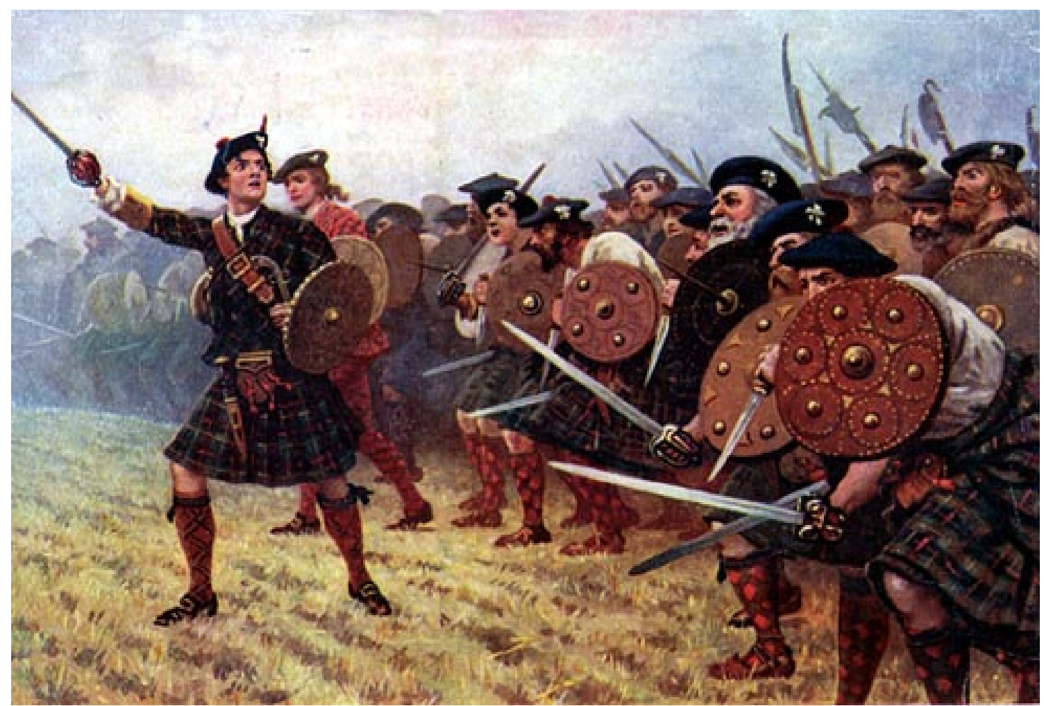
The Jacobite Rebellion of 1745, Highlanders armed with Broad Swords, Dirks and Targe (shield)