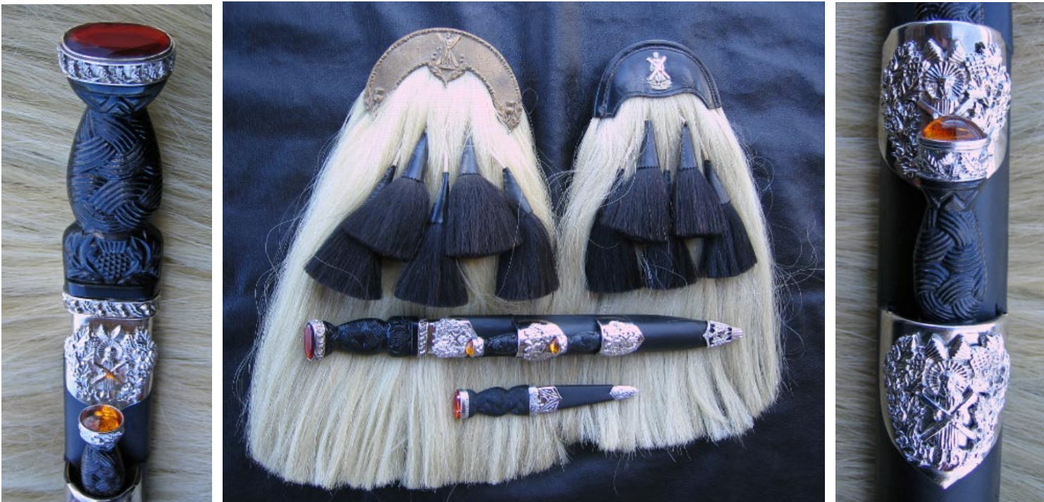
Traditional Dress or Pipers jewel top 12" blade Dirk with jewel top eating knife & fork, with matching jewel top 3 5/8" blade Sgian Dubh, resting on traditional New Zealand Military Sporrans, Officers left, O/Rs right, both same as Royal Highland Regiment – "Black Watch"

Right: From 1978 onwards all vehicles were repainted in the MERDC Red Desert scheme (NZ32503, MacIntyre) in 1988 at Waiouru. The unit serial number was changed to 72 in the early 1980s. (R J Fleming)