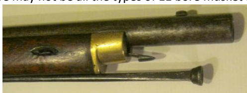
Pattern F Catch