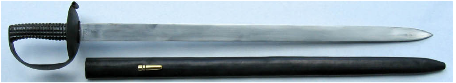
Pattern 1804 28" x 1 1/8" wide straight blade with ribbed cast iron grip & sheet steel guard, Black leather scabbard brass mount clip