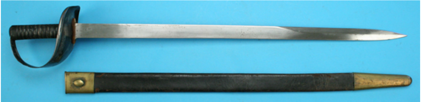
Pattern 1889 28" x 1 1/8" wide straight blade with ribbed cast iron grip & sheet steel guard, Black leather scabbard brass mounts