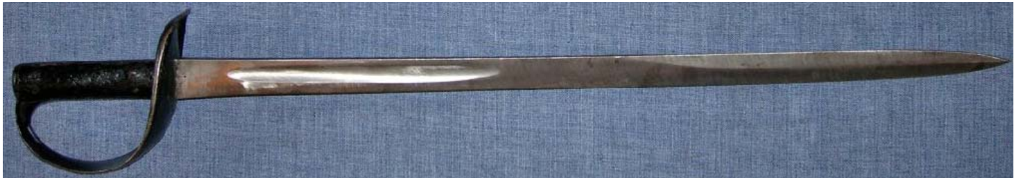
Pattern 1900 28" x 1 1/8" wide straight partly fullered blade with spear point, leather checkered grip & sheet steel guard,