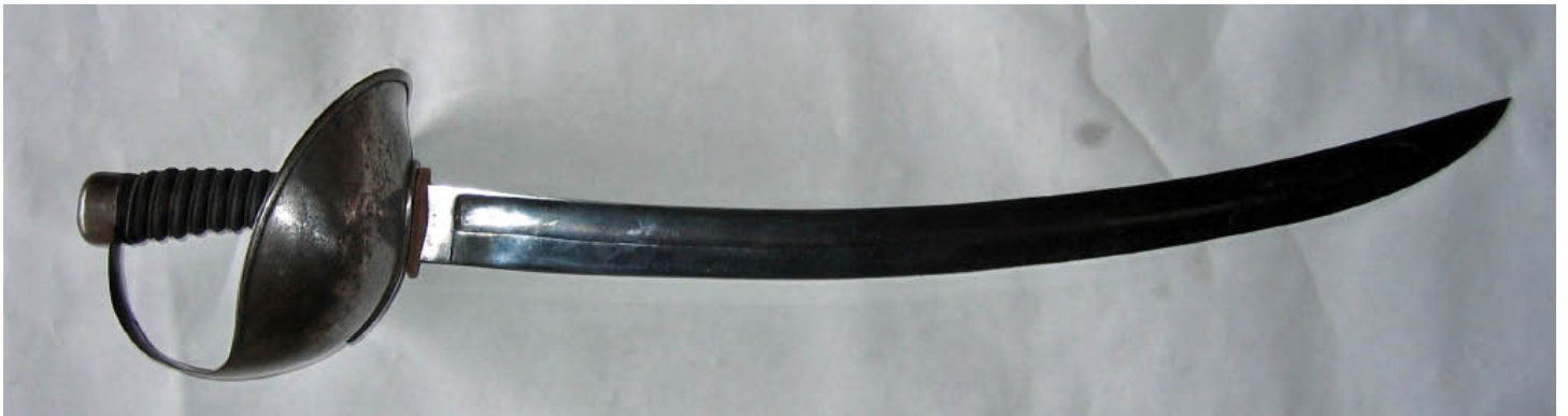
Pattern 1908 23 1/2" x 1 1/2" wide curved fullered blade with hatchet point, wire bound fish skin grip.