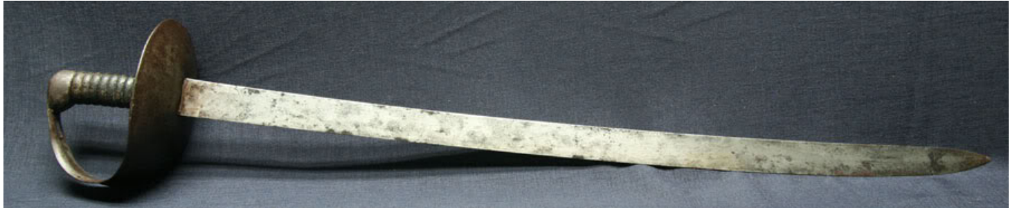
Pattern 1845 28" x 1 1/8" wide curved blade with ribbed cast iron grip & sheet steel guard,