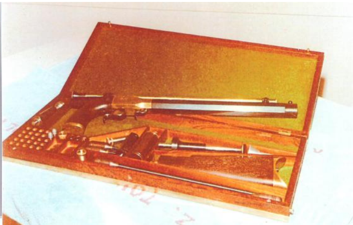
Brian Redwoods personal Buggy Rifle. Under Hammer target pistol-carbine 14 inch octagonal barrel in .40 calibre 1 1/2" across the flats with saw handle type pistol stock with a detachable shoulder stock