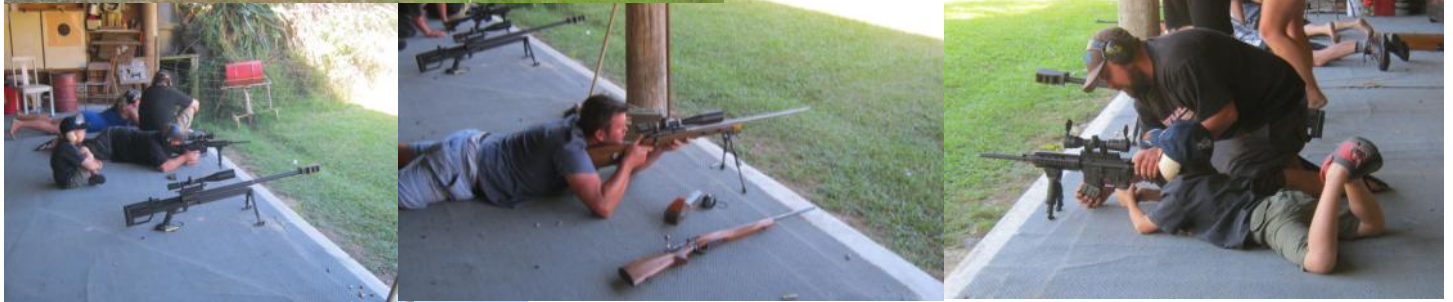
Just a few of the firearms in use at the weekend.