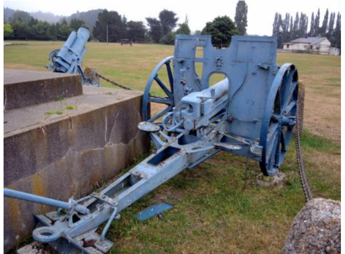
Another gun at the Kuriheka estate Memorial

WW I German trophy 77 mm FK 98 n/A, s/n Nr 9419. Made by Fred Krupp in 1916 originally presented to Dunedin in June 1919.