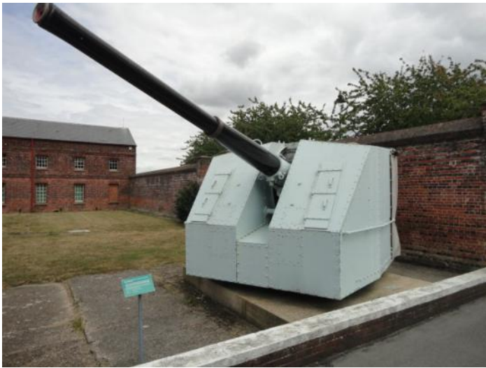
4.7 Inch Mark 1XB Gun on Central Pivot Mark XX11 single Mounting.

Out side items are scattered around the site so will leave stored items for next article.