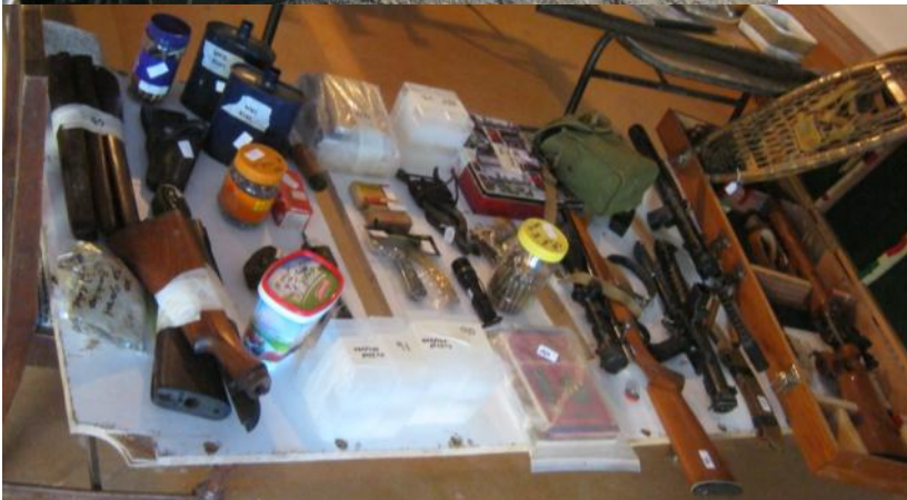
JC inspecting auction lots