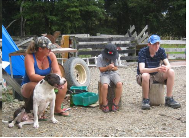
Above members and guests waiting patiently while the cooks prepare the meat below left