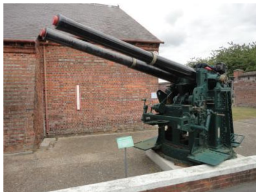
Right - 4" QE M XVI Naval guns on adapted Twin Mounting. Range 18.2km AP 17.35 kg, HE 15.88kg, firing rate 15-20 rounds per minute. This unit was built in 1940 & was one of 2,555 produced including Australia & Canada.