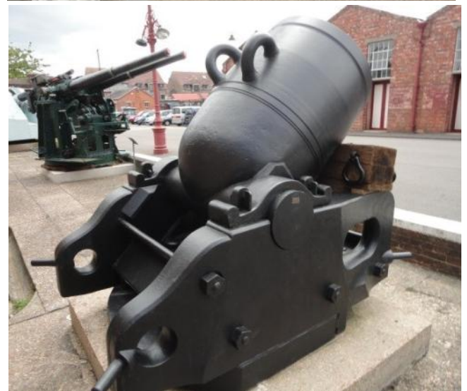
113" 1856 Mortar & Bed. This beast was donated by the Royal Armouries in 2000 having come from one the Portsmouth Hill Forts. Manufactured 1856 by FP & Co, this was capable of firing 2.8 km a 90kg filled shell. Weight - 3,500 kg ?