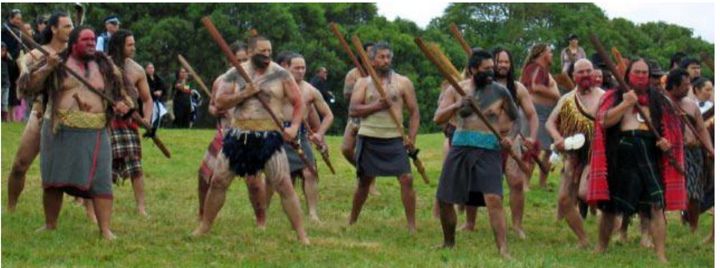
Maori Warriors perform a Haka

Dawn Blessing of Pou Whenua, which are carved posts placed strategically on the land to acknowledge and represent the relationship between Tāngata Whenua (the people of the land), their ancestors and their environment or tūrangawaewae (place of standing). They mark the ancestral and contemporary associations between the people (tāngata) and the land (whenua), and as such are very significant to both Māori and their contribution to New Zealand's cultural heritage and identity.