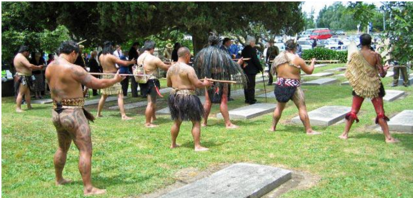
Representatives of Tainui Warriors with their traditional dress and arms-Taiaha, Tewhatewha & Mere, facing Soldiers with their present day Steyr rifles