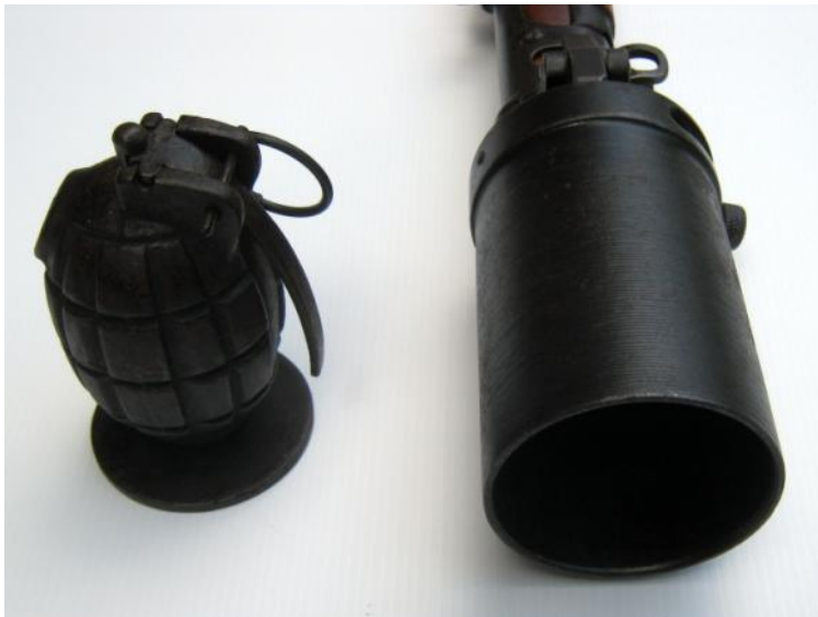
No 36 Grenade with Grenade Cup fitted to an SMLE

FROM THE WWW (ctrl+click to follow the link or copy and paste to your browser)