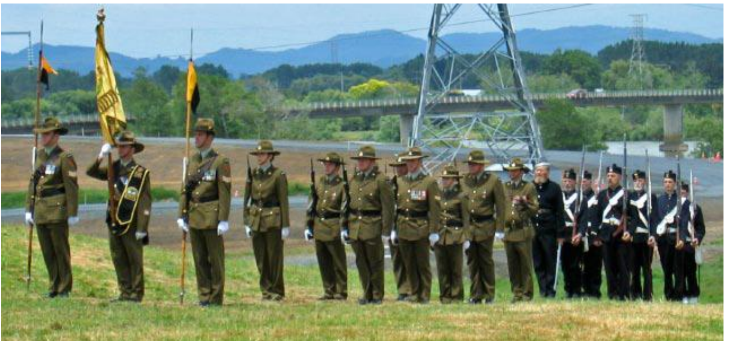
New Zealand Army Colour Guard and 65th Regiment Reenactment Group.