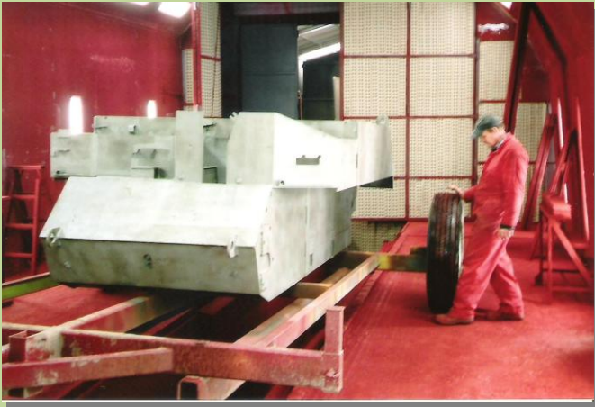
The hull repaired, sandblasted ready for painting