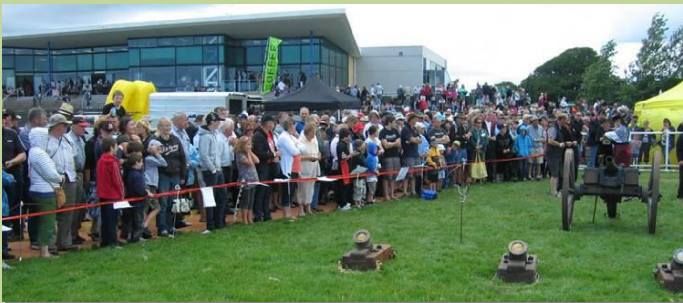
Note the slow match held in the linstock behind the Coehorn Mortars

Police Permission is required to discharge firearms in a public place. As part of the conditions the Wanganui District Arms Officer was in attendance for the first series of Gun Salutes at 11am he seemed happy with all the Safety aspects and outcomes.