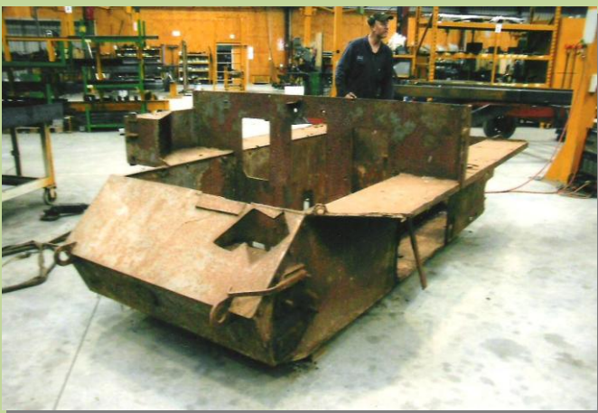
In the beginning: Carrier hull arrives in the workshop