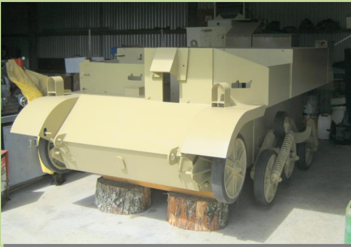
In Colin's shed January 2012