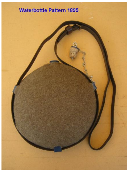
Waterbottle Pattern 1895