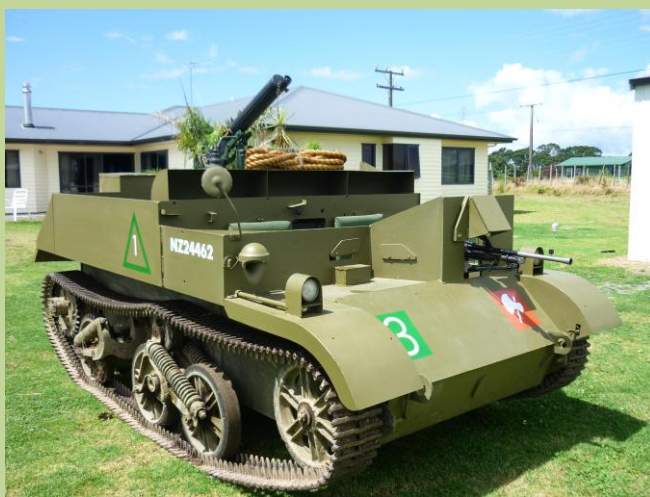
Later Carrier LP 2 welded construction