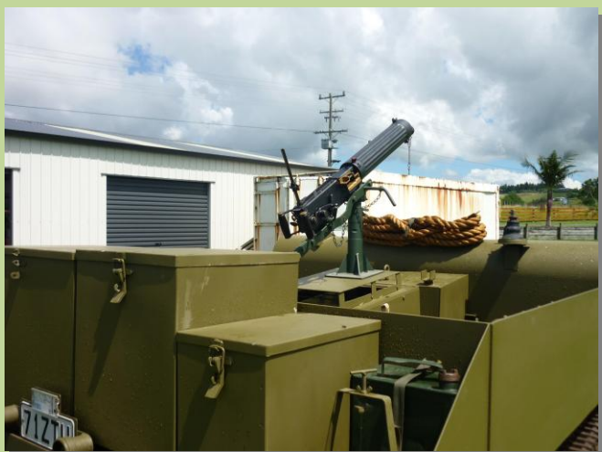
Rear mounted Vickers MG