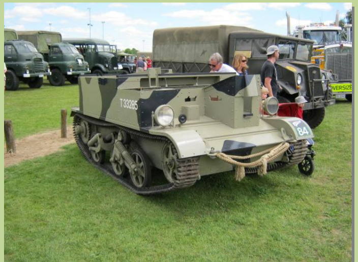
Armistice in Cambridge November 2010 (LP 1)