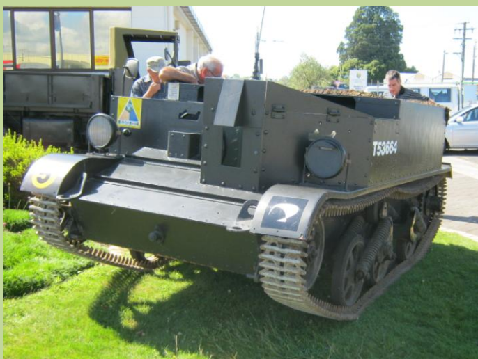
Otorohanga Feb 2012 (LP 1)

Engine: No 1 65 HP, No 2 85 hp, No 3 95 hp Usually Ford 8 cylinder.