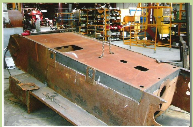
Hull repair commences