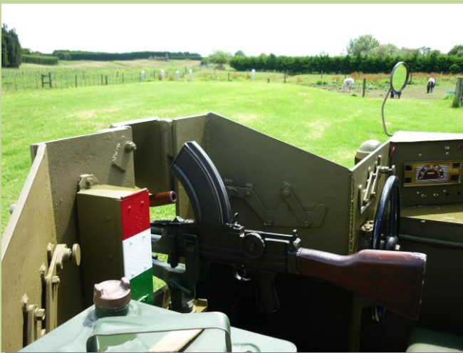
Front mounted Bren LMG

These vehicles were used by both Divisional Cavalry and Infantry, they were built in Britain and locally in New Zealand, initially from British plans and later to an Australian design.