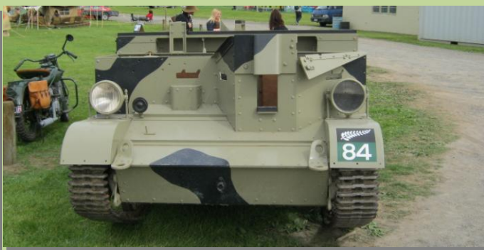
Early Carrier Bren LP No 1 (NZ) riveted construction