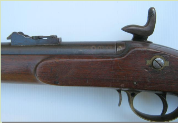
LHS of breech