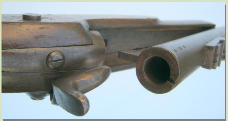
Pin-fire chamber and hinge shoe