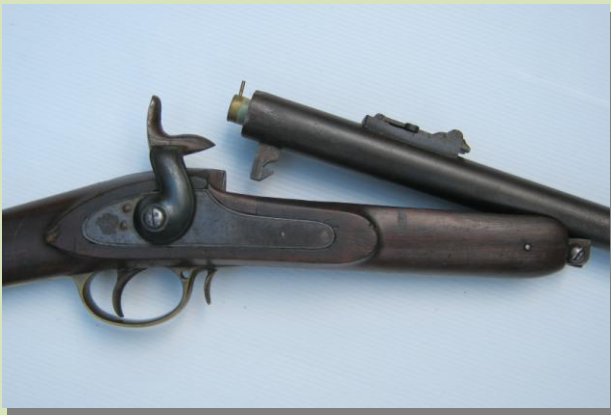
Modified hammer and latch

This 25 bore (.577 calibre) Pattern 53 Enfield has been turned into a breech loading pin-fire sporting rifle. This was achieved by cutting the barrel at the breech plug and chambering it for a pin-fire cartridge. The hammer has been modified to strike the pin and the barrel has been hinged to the stock by brazing a hinge lug to the barrel and fitting a shoe inside the cut down stock, with a release catch just forward of the trigger guard. The original sights are retained.