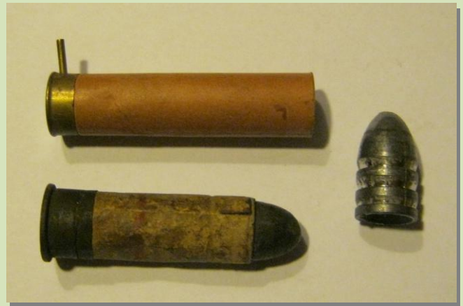
24 bore pin-fire cartridge & .577 Snider Round

The answer is no, visit the link below to find out why.