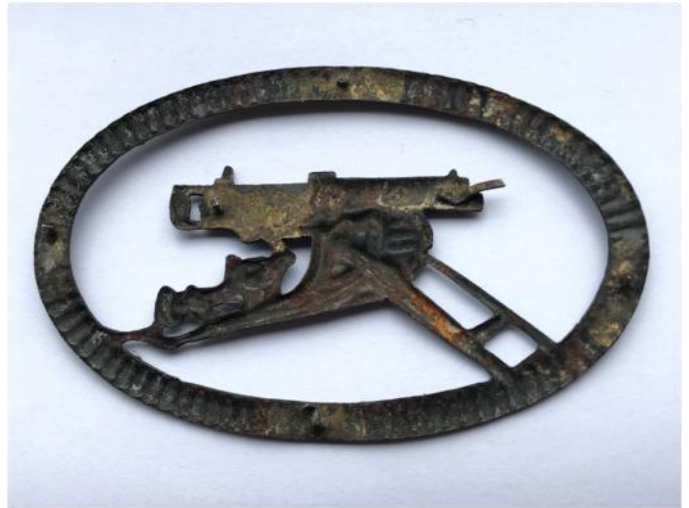
MGSS Badge, late war production by Junker