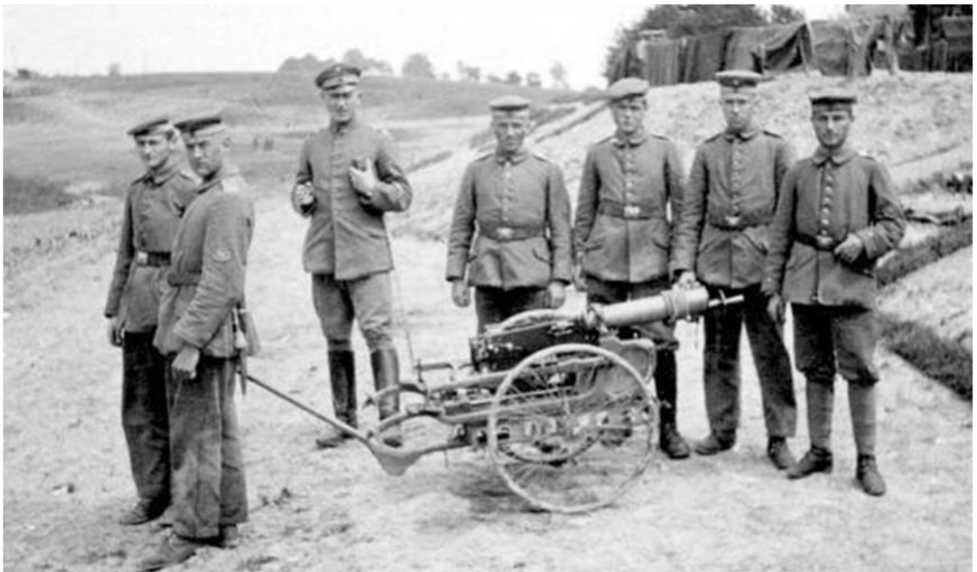
MGSS troops with MG08 on transport cart

One disadvantage of the MGSS insignia was ready identification of a soldier as a machine gunner if captured. These guys were liable to be given “special treatment” due to the heavy toll the MG had on opposing troops. Many such badges would have been hurriedly removed and discarded because of this just as they would have been removed on capture for souvenirs as taking a machine gun was considered a huge event by those capturing guns and positions.