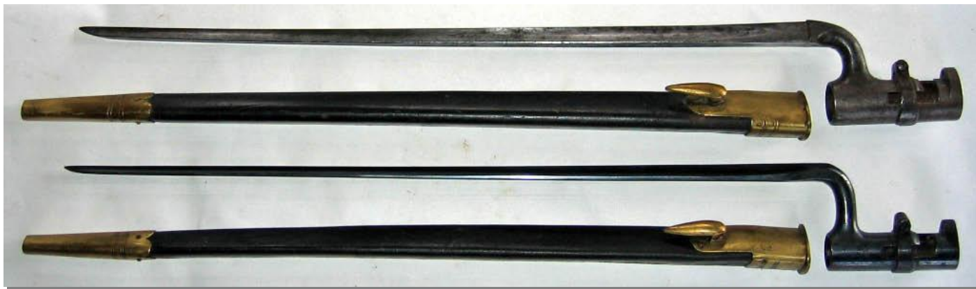
Top Pattern 1853 Socket Bayonet, Bottom: NZ issue Remington Lee Socket Bayonet