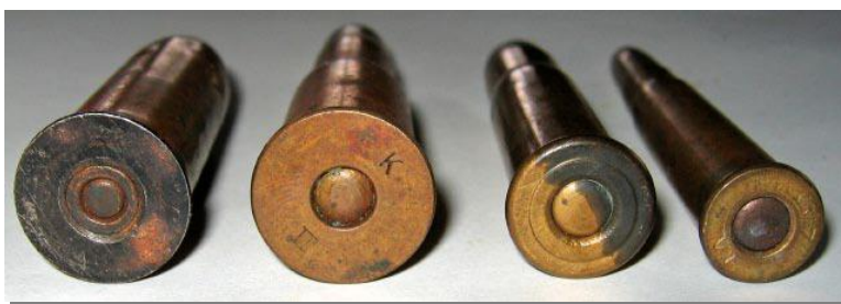
Comparison of ammunition: .577 Snider 1869, 577/450 Martini Henry 1885, .43 Spanish 1887, .303 British 1898