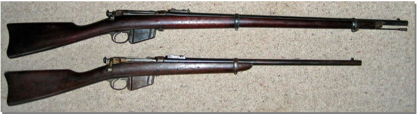
Top: Remington Lee M 1885 Service Rifle, Bottom: M 1885 cut down to carbine

Markings: Makers name and serial No on left receiver wall, NZ Issue marks on breech N^Z/87.