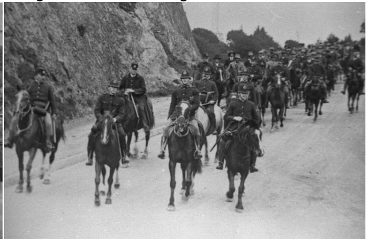
New Zealand Police armed with the regulation pattern Long Batons and .450 caliber revolvers 1913