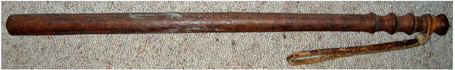
NZ Police Long hard wooden baton length 27.5" max diameter 1.35" with leather wrist strap 1913

The 1913 strike was a very significant event in New Zealand's industrial relations history. Along with the 1890 maritime dispute and the 1951 waterfront lockout, it stands as one of the three major industrial confrontations in our history.