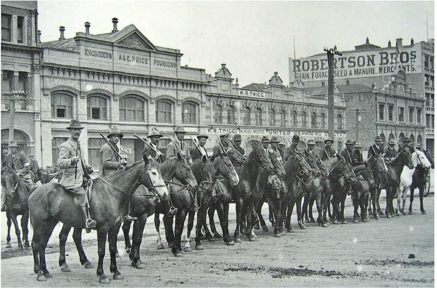
Special Constables "Massey's Cossacks" armed with Long batons and a few Long Axe handles 1913

strikers were defeated, but they won the campaign. The use of the special constables, Massey's Cossacks, against the strikers, helped unite the various labour factions into one party. When the Labour Party was formed in 1916, the party was united in achieving economic and social change.