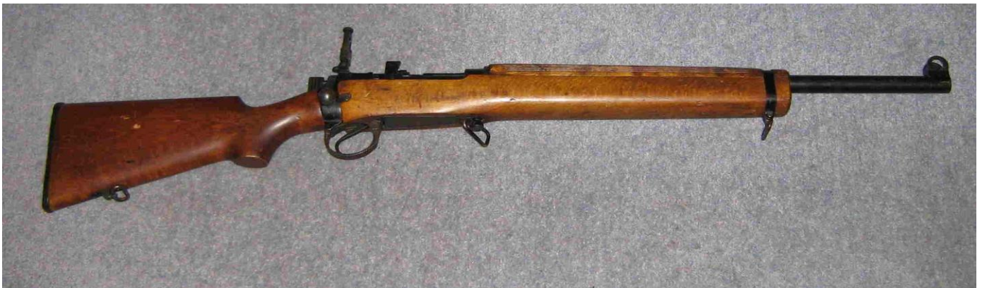
Fazakerley No 8 Mk I

The No 8 was produced to meet the needs of a training rifle and also to be used in small bore competition. Although the site picture resembles that of a No 4 and it is built on a No 4 or No 5 action body it bears little resemblance to its .303 parent. The butt has a composite butt plate and more pronounced pistol grip, it is half stocked with a wide fore-end and it has a heavy target barrel. The bolt and trigger are a new design and while the rear sight is the Mk I singer type it is graduated to 25, 50 and 100 yds.