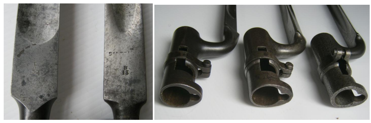
Markings Left: Enfield, Right: Salter Socket MRD to fit: Enfield 20 mm, Hay 21 mm, Martini Henry 18.1mm

Approved in October 1853 this was the first British socket bayonet to use a locking ring and was made for the Pattern 1853 Enfield Rifled Musket. It also served these rifles when converted to Snider breech loading in the late 1860s and other muzzle loaders of the era such as the Hay Pattern1858 Medium Rifle. It was also bushed to fit the Martini Henry Rifle when this was introduced in the 1870s.