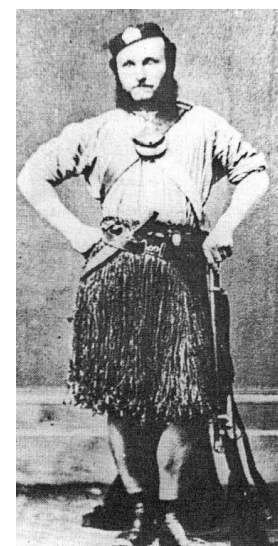
Left: Captain Charles Westrupp's No1 Company Forest Rangers at a Stockade Camp, Poverty Bay, 1865. Centre: Wanganui Militiamen c1865. Right: Sgt Arthur Wakefield Carkeek (awarded the New Zealand Cross) New Zealand Armed Constabulary Field Force c1869. Armed with 30 bore (.54" caliber) Terry Breech loading Carbines and 54 bore (.44") Beaumont Adams 5 Chamber Revolver. Cap pouch on cross belt, Revolver in holster, carbine, & revolver ammunition pouches on waist belt.