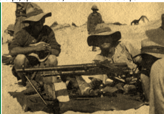
NZMR with a MKI Hotchkiss .303" c1917.