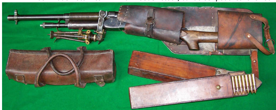
British made .303" MKI Hotchkiss saddlery