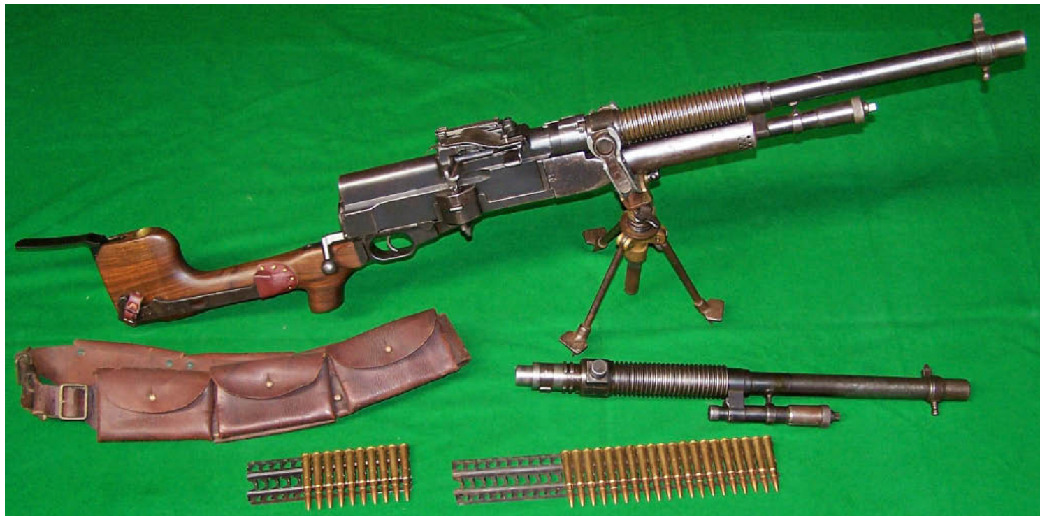
British made Hotchkiss MKI with wooden stock, bandoleer pouches for 9 round clips, spare barrel, 14 and 30 round clips

Specifications; Maker: British RSAF. Model: Hotchkiss P1915?, gas operated Light Machine Gun, caliber .303", OA length 46.75" air cooled with cooling fins, rear sight graduated to 2000 yards. Ammunition feed rigid strip of 9, 14 or 30 rounds or semi-rigid belt of 50 rounds. Rate of fire 450 rounds per minute, it could also be fired in single shot mode at a rate of 100 rounds per minute. Weight 31lbs with tripod.