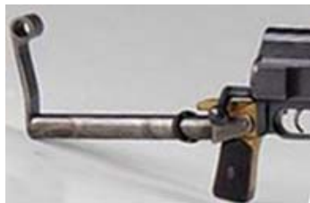
Alternative detachable tubular stock.