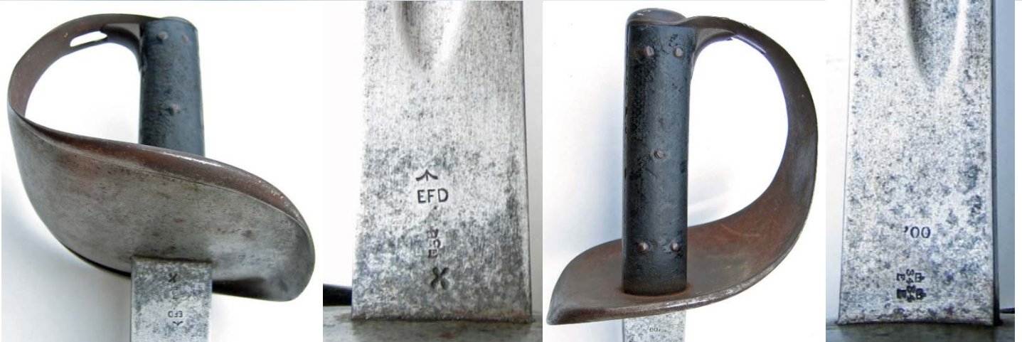
EFD makers, & proof / WD acceptance marks