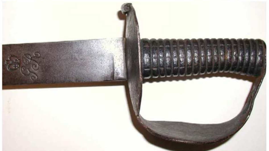
figure 8 hilt, with ribbed cast iron grip