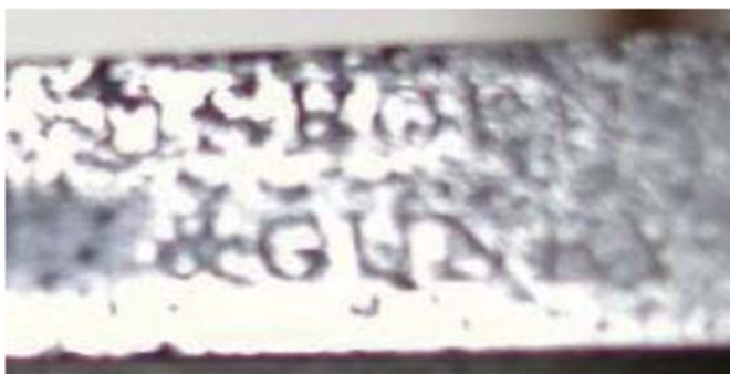
Makers name OSBORN & GUNBY engraved on back of blade