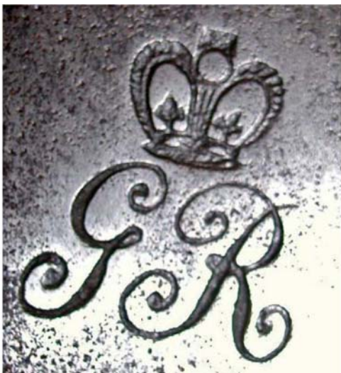
Engraved Crown over George III 1760–1820 / George IV 1820-1830