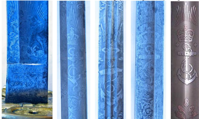
Examples of acid etched blades