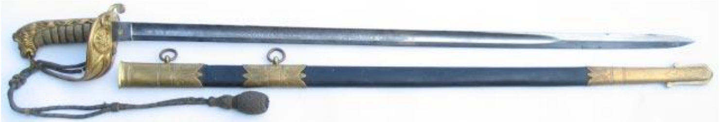
British and NZ Navy officer's sword with Wilkinson blade pattern 1827/46, fishskin grip. Black leather gilded brass mounted scabbard,

Specifications; Maker: Wilkinson and others. Blade: Top Wilkinson design, fullered, slightly curved 1" wide, 31 1/2" long double-edged at spear point. Gilded brass half basket hilt with hinged inner flap pierced with security hole to lock over a pin on locket, holes in the bowl and top bar for the sword knot / wrist thong, wire bound fish skin grip, lion head pommel with full length mane down the back strap. The blade is acid etched with floral designs and crown over fouled anchor. Scabbard: Black leather with gilded brass fittings. The P1827 sword hilt (with changes) has remained the regulation pattern for British & NZ Navy officers to date. Some Scottish Naval officers preferred the traditional broadsword blade c1860-80s, the Wilkinson design blade was replaced in 1928 with a 3/4" wide 32" long dumbbell shape single fullered straight blade.