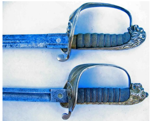
Top: Scottish broadsword blade, lower: extended grip from 1895