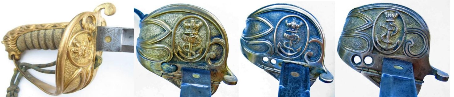
British Royal Naval Officers Sword Pattern 1827/46 with Wilkinson blade - with broadsword blade 1860-80s - lengthened grip from 1895 Above: all Wilkinson Sword Co proofed - with wire bound fish skin grips, gilt brass hilt with Queen Victoria Crown over fouled anchor .

New Zealand Service: Types used by officers of British Royal Navy warships in NZ and New Zealand naval officers. They all have New Zealand provenance