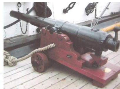
Naval Armstrong gun