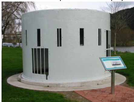
Pioneer Cupola at Ngaruwahia

On 24 December 1867 she was wrecked on the Manukau bar, after dragging her anchor in a Waikato flood and being swept out to sea. The two cupolas are on display in Mercer (as part of the war memorial) and Ngaruwahia.