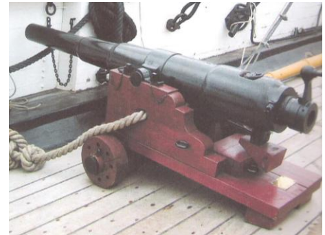
Naval Armstrong gun