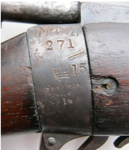
Manufactured BSA & M Co. 1892, NZ Issue 1915