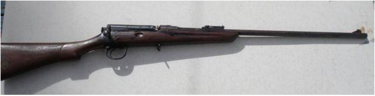
This example appears to have been converted at a later time to a sporting rifle.