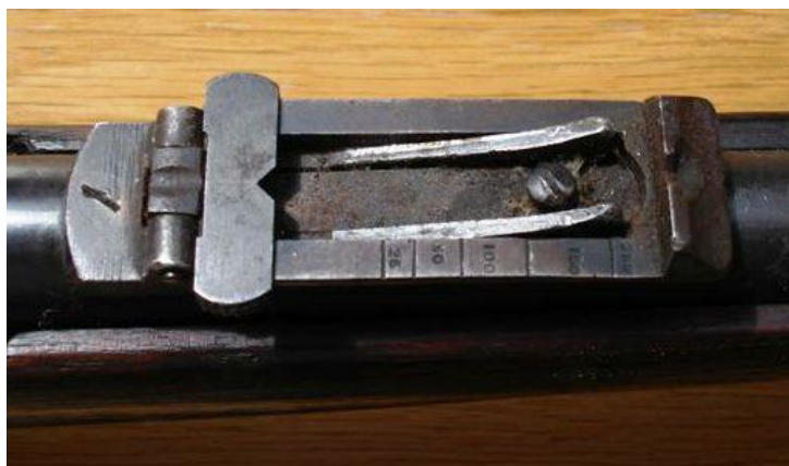
Rear sight graduations