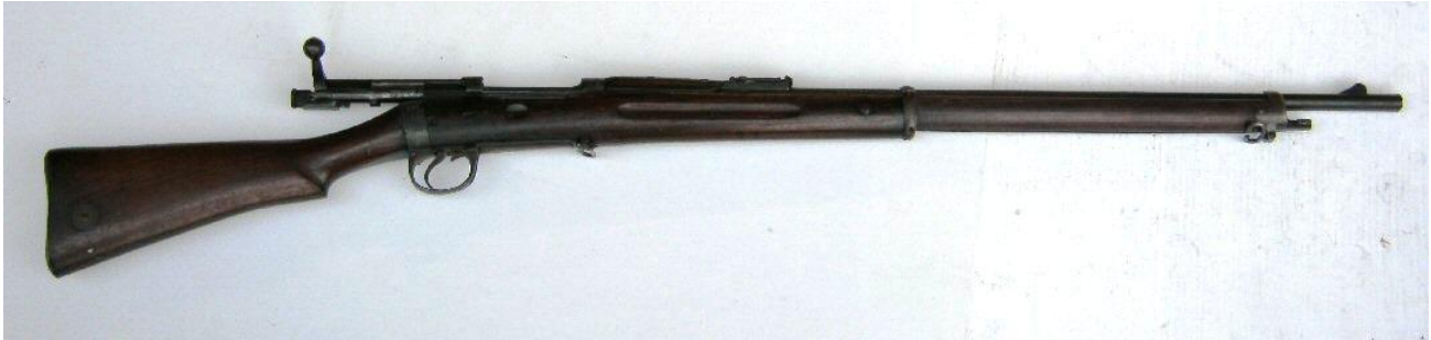
MLM Converted to .22 RF by CG Bonehill

Magazine: None, Sights: Rear sight 25,50,100,150,200 yds on ladder