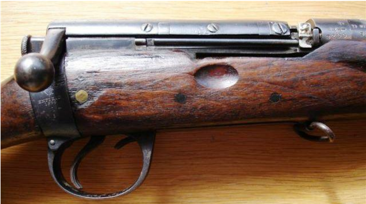
Close up of bolt, cut off and magazine removed

The 1914 Defence return states: "300 miniature .22 rifles under order and our Representative at the War Office is now dealing with the question of providing miniature rifles as cheaply as possible". In a letter dated 7 April 1914 the Major General Commanding NZ Military Forces recommended the purchase and conversion of 400 MLM rifles to .22. Subsequent to a cable to the NZ High Commission on 14 April 1914 an order was placed with CG Bonehill of Birmingham to convert 300 old Metford Rifles to .22 LR by fitting new barrels with 8 groove rifling, and adapted striker mechanism, blocking the magazine well with wood block and graduating the rear sight to ,25, 50, 100, 150, 200 yds.