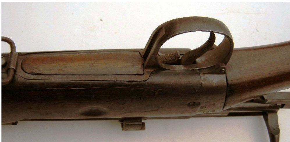
Magazine well blanked by wood block