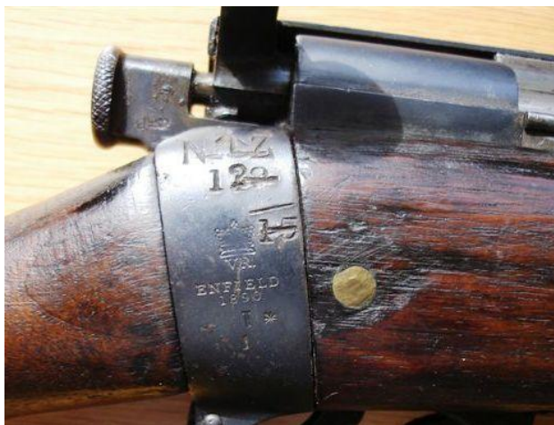
Enfield Manufacture as MLM in 1890, NZ Issue 1915