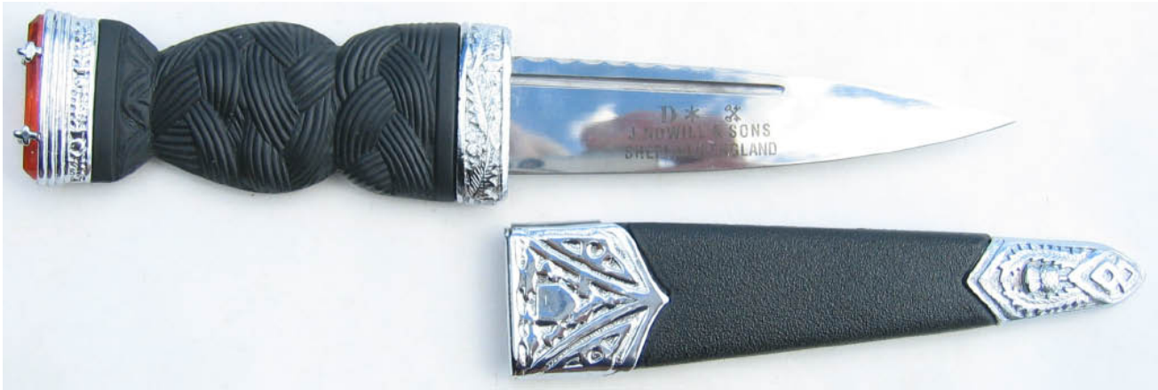
The blade is marked with trademarks - D Star and crossed keys / J. NOWILL & SONS / SHEFFIELD ENGLAND

This example of a traditional jewel top Scottish Sgian Dubh made by John Nowill & Sons, Sheffield, England has a grooved blade length 3.68" (93mm) width 0.68" (21mm) thickness 0.1" (2.4mm) tapering to a spear point. The cast metal furniture on the knife and sheath is engraved with traditional Scottish designs. Provenance: The SGIAN-DUBH was reputed to have been carried by some members of the New Zealand Forest Rangers 1863-67 and some members of the Armed Constabulary Field Force from 1867-1886 and by the various New Zealand Highland Rifle Volunteers from 1885. With dress (Black Watch) uniform by some members of the New Zealand Scottish Pipe Band from 1939. Also traditionally worn by some members of Military, Police and Civilian Highland Pipe Bands in NZ and worldwide.