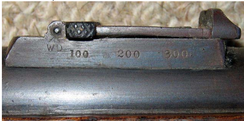
Rear sight ramp 100 to 300yards