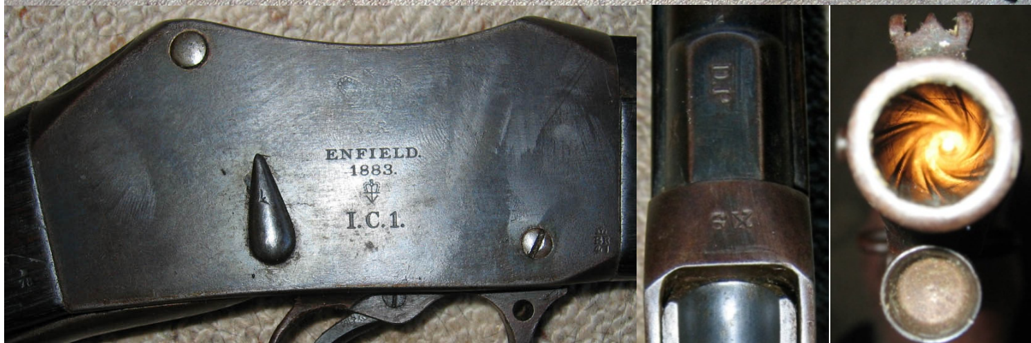
MH Artillery Carbine MKI Enfield 1883.