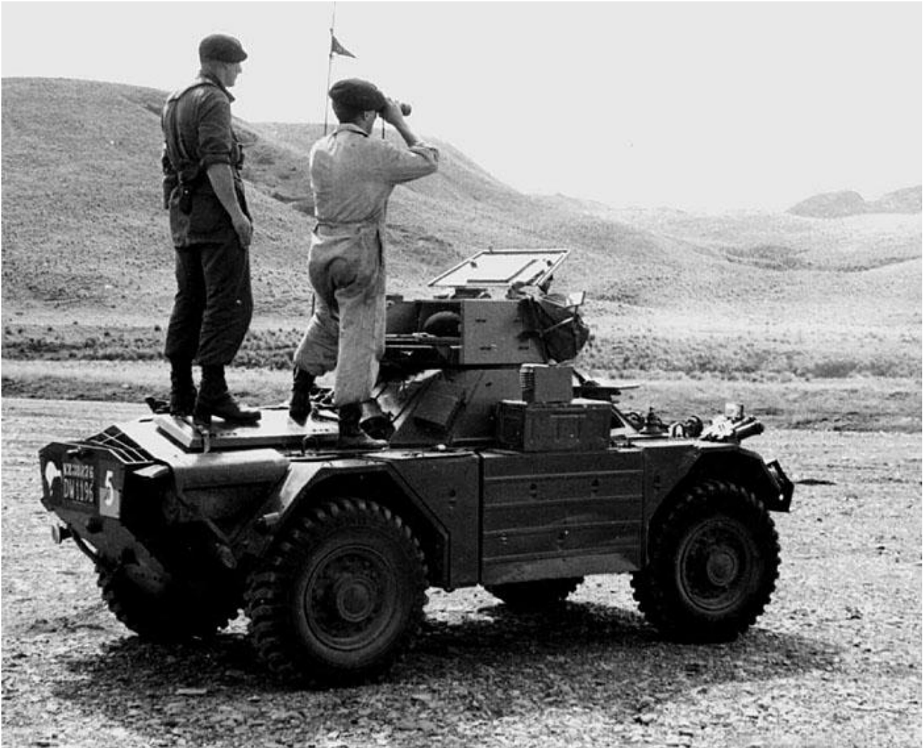
A Ferret Mk II Scout Car of 1 st Reconnaissance Squadron (NZ Scottish) in mid 1960s

Max Speed: 58 mph (93 km/h), Range: 190 mi (310 km)