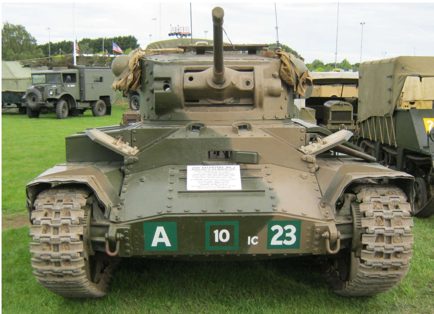
Valentine Mk II

1940 VALENTINE Mk 2 BRITISH BUILT 16 TON INFANTRY TANK HISTORY; INTRODUCED TO THE NZ ARMY 1st, 2nd, & 3rd BATTALIONS 1941. VARIOUS MODIFICATIONS WERE MADE DURING THE TANKS SERVICE WHICH LASTED UNTIL 1960 WHEN IT WAS REPLACED BY USA BUILT M41A1 LIGHT TANK NZ VALENTINES FOUGHT AT VELLA LAVELLA & GREEN Is. BUT WERE MAINLY USED IN TRAINING CREW, 4 PERSON ENGINE; 131hp AEC ARMAMENT; 1X2 PDR 1X7.62 MG MAX SPEED; 24k/h 15m/h RANGE 144 km 90 miles TRENCH; 2.36m 7ft 9in GRADIENT; 60%