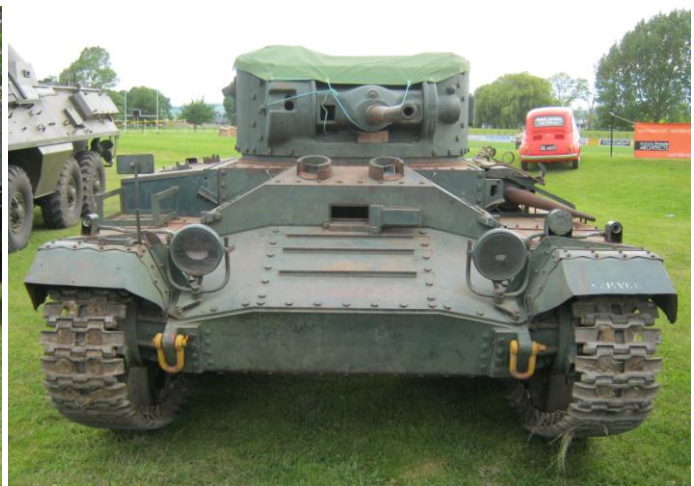
Valentine Mk III